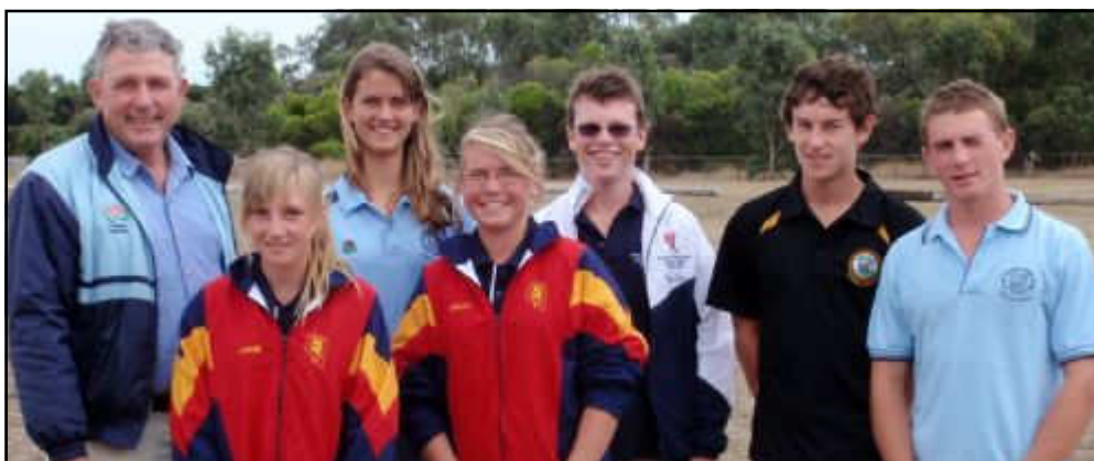
2010 Australian Team for International Mounted Games